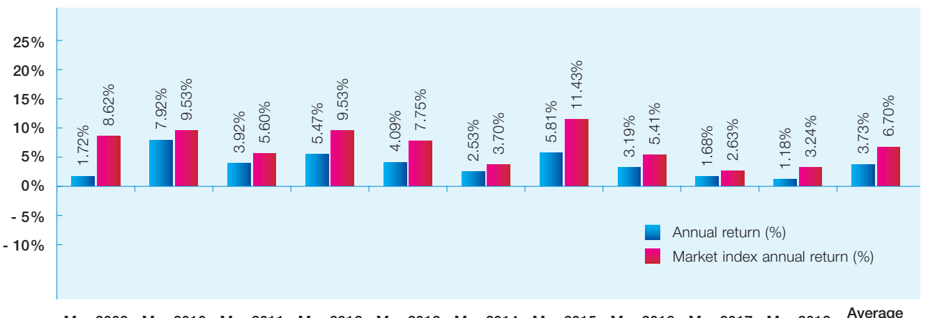
Mar 2009 Mar 2010 Mar 2011 Mar 2012 Mar 2013 Mar 2014 Mar 2015 Mar 2016 Mar 2017 Mar 2018 Average annual return

This shows the return after fund charges and tax for each of the last 10 years ending 31 March. The last bar shows the average annual return for the last 10 years up to 31 March 2018.