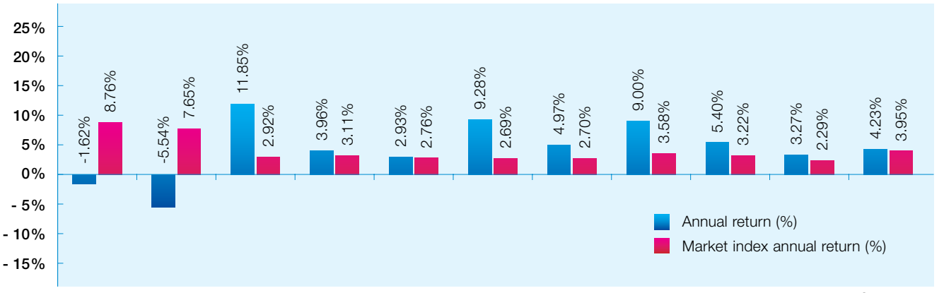
Mar 2008 Mar 2009 Mar 2010 Mar 2011 Mar 2012 Mar 2013 Mar 2014 Mar 2015 Mar 2016 Mar 2017